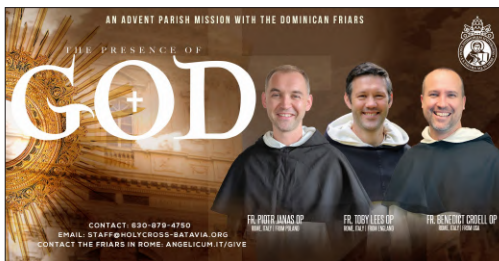
Parish missions in the U.S.

Last year Angelicum friars preached a Lenten parish mission in Florida that was attended by thousands of people. Myself & two other Dominican priest-preachers each heard over 24 hours of confessions! We will be doing a second mission in Advent, this time in Illinois, if you are free to join us. You can also follow the mission virtually if you so desire: http://bit.ly/HolyCrossMission