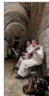
Friars entertain Guests

Eternal City as well. The exclusive Vatican insider tours were