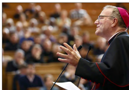
Bishop Barron receives honorary doctorate

Finally, my office organized our university's major event of his Excellency, Bishop Robert Barron receiving the honorary doctorate. Bishop Barron is world-