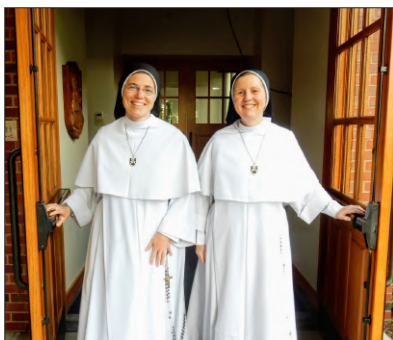
Dominican Sisters of Mary, Mother of the Eucharist in the mission advancement office