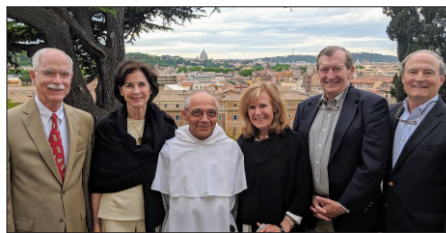
Donor "homecoming"/come and see days

The past year has been full! My office, with the help of our new internship program, has created new brochures, updated The Angelicum newsletter, and our student publication. We've created EWTN radio spots (USA) and a more user-friendly website. Be sure to take a look at it: angelicum.it